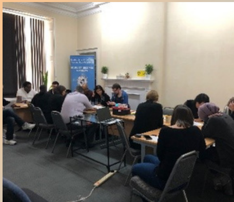
Multiplier Event in Edinburgh