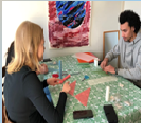
Multiplier Event in Finland