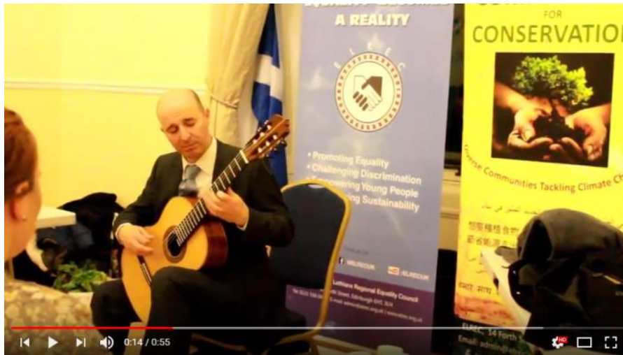
Video Excerpt from Ayman Jarjour's performance.

In celebration of #ScotClimateWeek 2017, the Communities for Conservation held the Autumn Celebration 2017. The evening brought 150 people from many local communities together to develop knowledge about ways we can all be more eco-friendly and lead more sustainable lifestyles. It was a festive event with great diversity of people, stalls and activities to celebrate climate action. Stallholders included Home Energy Scotland, RSPB Scotland, Forestry Commission Scotland, the Cyrenians, Love Food Hate Waste, Face Painting and Henna painting, Upcycling, Food growing, and Energy efficiency activities. Thank you to all who came down and contributed to a wonderful event particularly to all the volunteers. Thank you to the funders the Climate Challenge Fund managed by the excellent environmental charity Keep Scotland Beautiful for making those events possible. The evening culminated in a mesmerizing performance from the renowned Syrian classical Guitarist, Ayman Jarjour . Ayman performed a wide range of the classical guitar repertoire, ranging from the traditional Spanish/Latin American, through Baroque and Classical, to contemporary music.