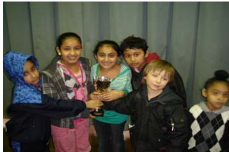
Young people from Sikh Sanjog with their Best Imagination trophy for their fantastic posters.

The aim of the talent show was to encourage primary age children to raise awareness of anti racism, diversity and equality to their friends and family. The young people hopefully gained some confidence from the talent show to challenge racism in their schools and communities. I believe that it would be fair to say that the show certainly exceeded its aims.