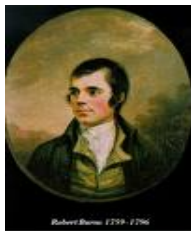
Robert Burns 1759-1796

Youthzone celebrated Chinese New year with various activities. One in particular that the young people were intrigued with was