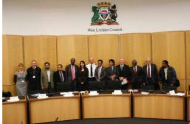
A few of the board members and special invitees pose for a picture after the meeting