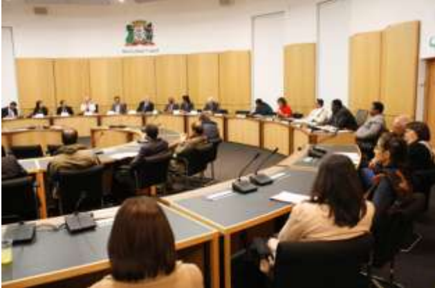
The AGM in progress at the West Lothian Council Chambers

19 October 2011 at West Lothian Civic Centre, Livingston