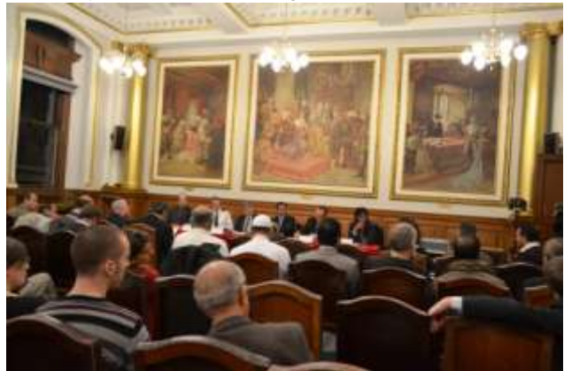
The consultation meeting in progress

For a list of our future events please go to: www.elrec.org.uk/events.htm