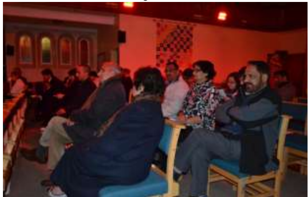
A section of the participants